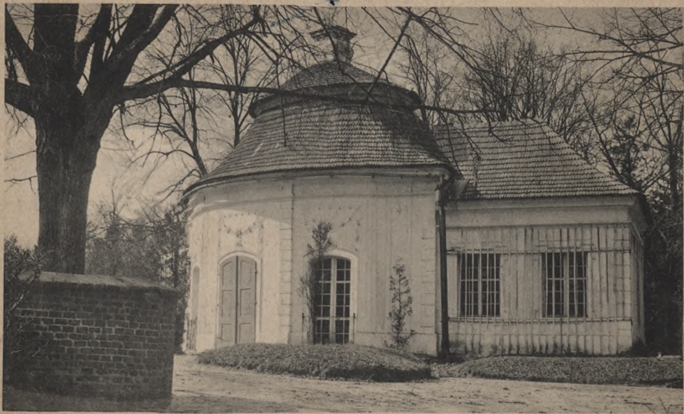
Carlsruhe i. Schl.