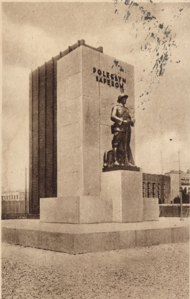
Warszawa. Pomnik Poległym Saperom