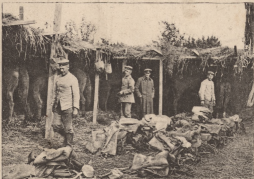
Ein improvisierter Pferdestall