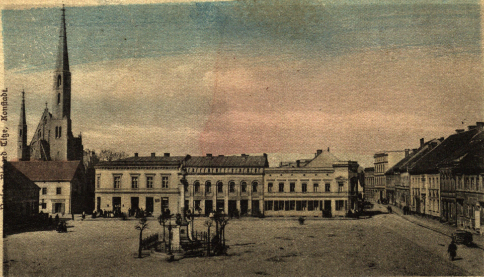
Marktplatz und Kath. Kirche.