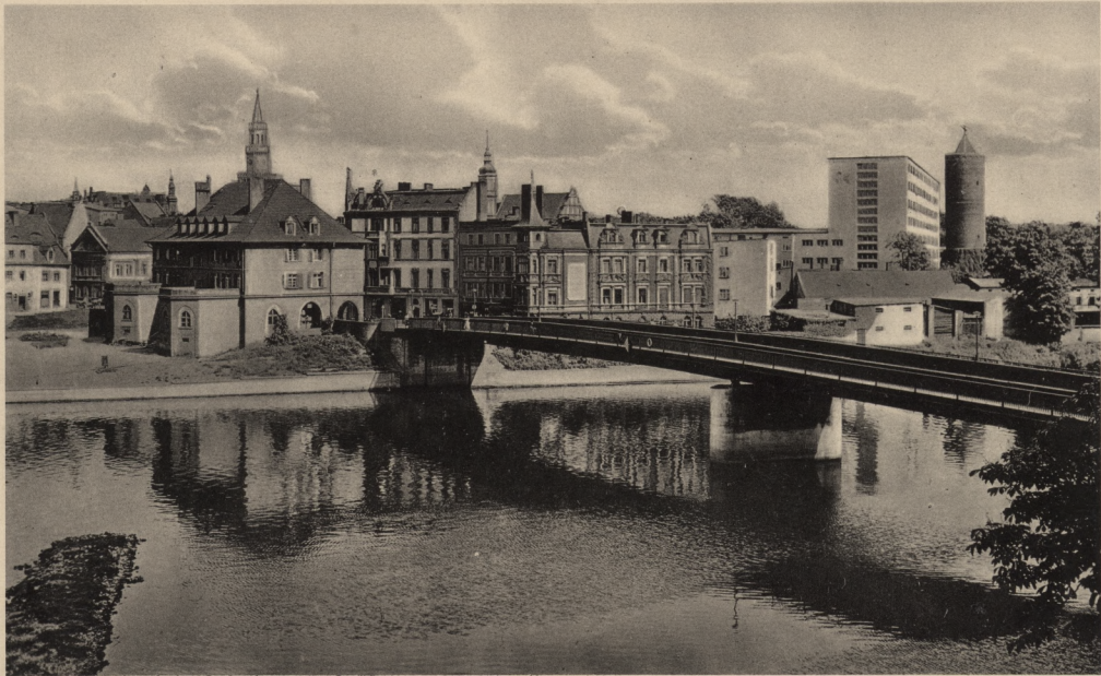
Oppeln, O/S. Blick über die Oder